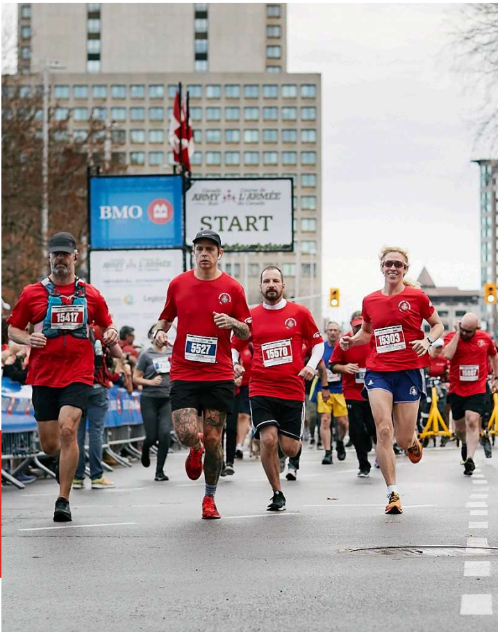
The Canada Army Run Soldier On team had 33 participants for 2023.

Canada Army Run continues to be a signature fundraising event for the Canadian Armed Forces official charitable causes, Support Our Troops and Soldier On. This year, over 13,000 participants walked, ran, or rolled either in person or virtually to celebrate our modern Canadian Army.