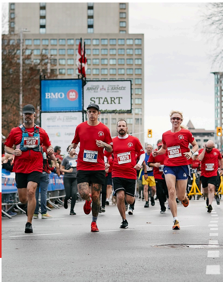
The Canada Army Run Soldier On team had 33 participants for 2023.

Canada Army Run continues to be a signature fundraising event for the Canadian Armed Forces official charitable causes, Support Our Troops and Soldier On. This year, over 13,000 participants walked, ran, or rolled either in person or virtually to celebrate our modern Canadian Army.